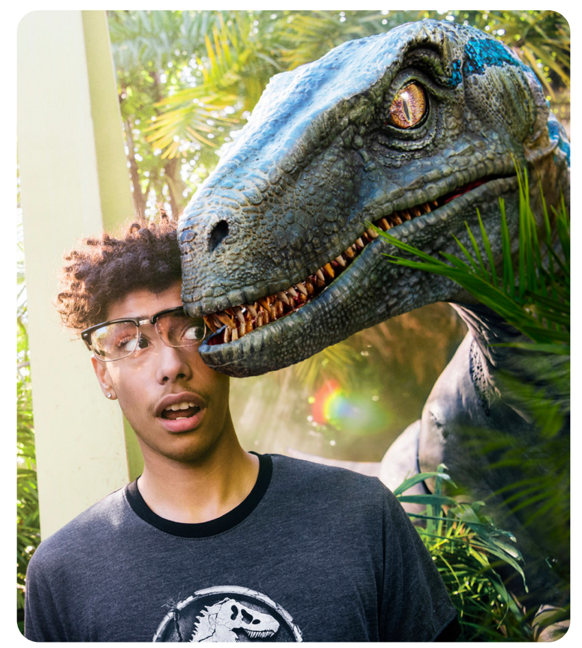
Imagery shown may not represent current operational and safety guidelines.

It's time to let loose with all your favourite people at Universal Orlando Resort. Those movies and TV shows you've binged are about to get really real at Universal Studios Florida. Ready to alternate your reality between dinosaurs, wizards, and superheroes? Universal's Islands of Adventure is calling your name.